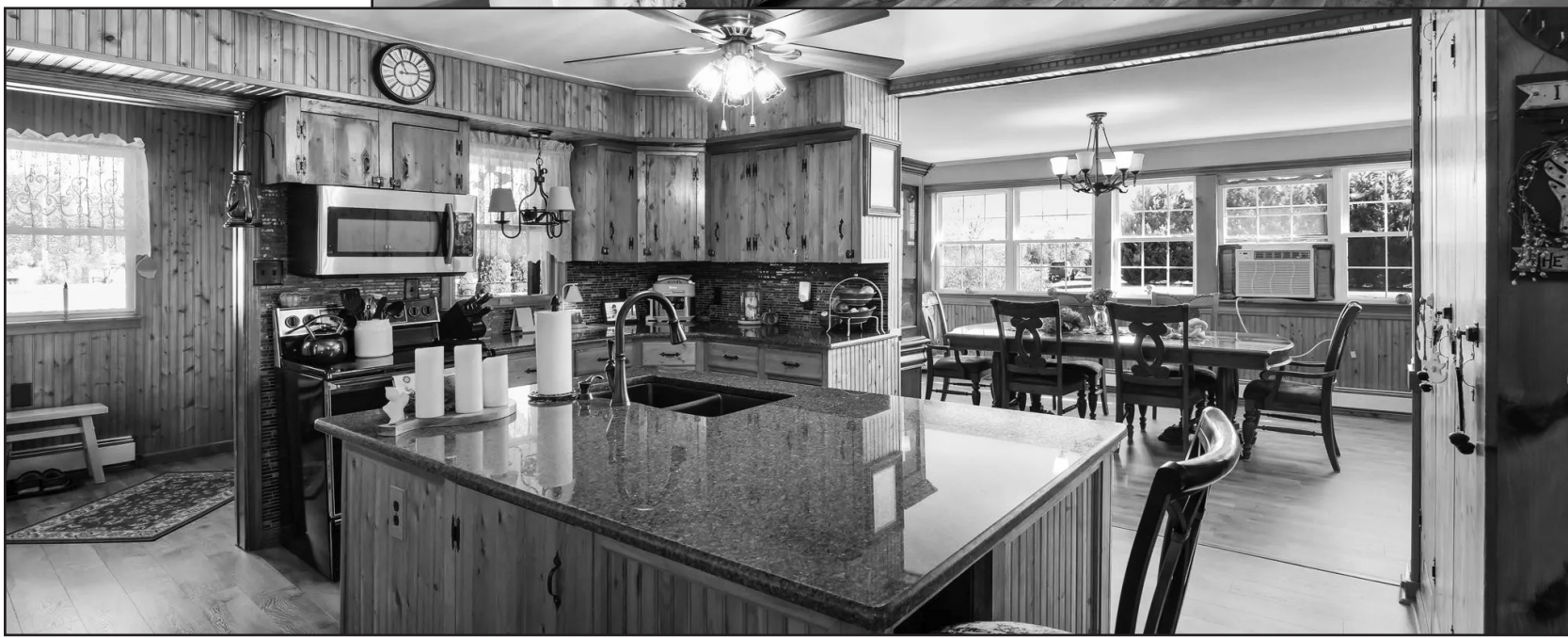
A spacious living room (above) and kitchen (left) are two of the features of this E. Central Avenue home.