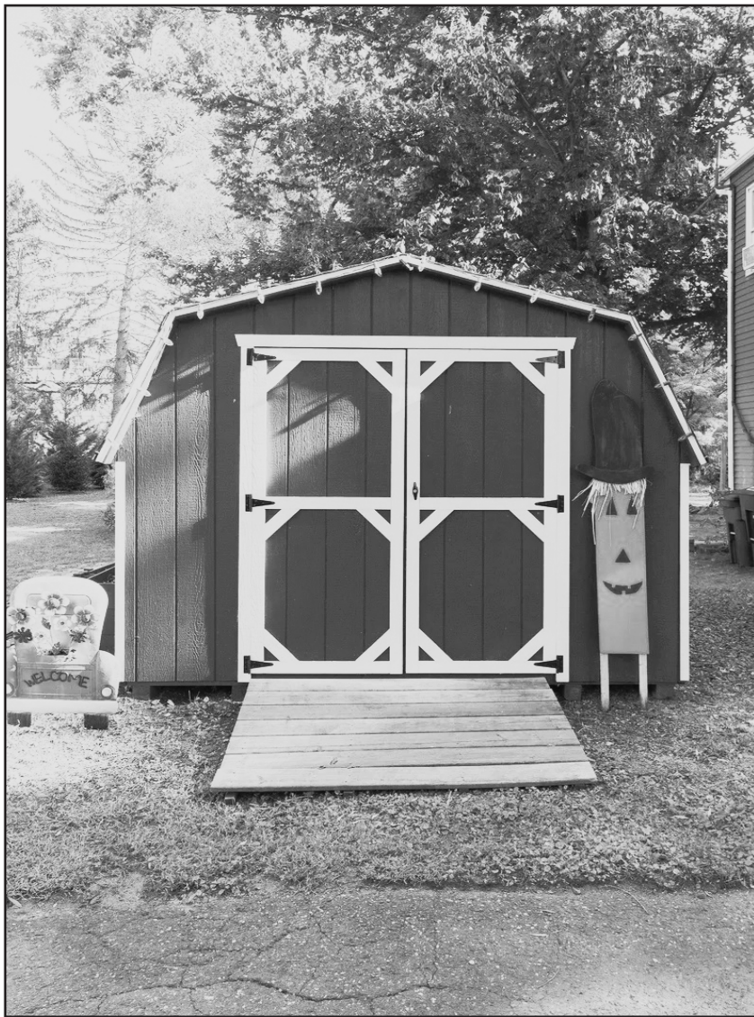
Above: The kitchen has a spacious layout with a large island. Below: A huge detached garage/workshop provides additional storage space.