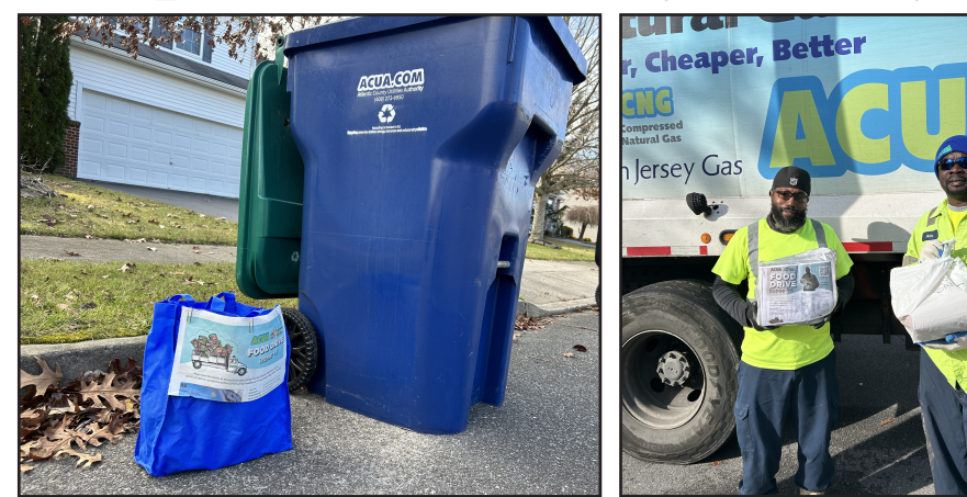
The ACUA is collecting food drive donations now through December 13. At right, Rashawn